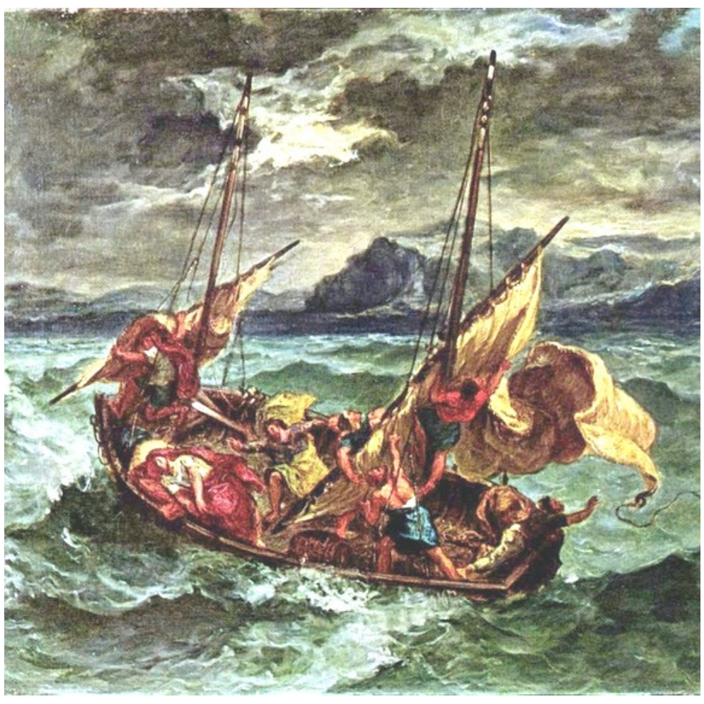
Christ and the Disciples on a Raging Sea